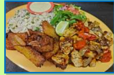
La Gordita Puerco