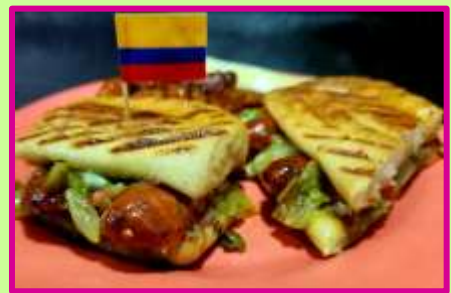
Grilled Choripan Sandwich