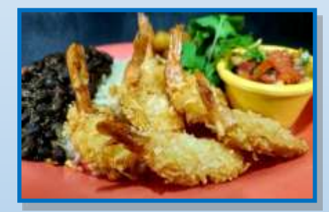
Coconut Shrimp Platter