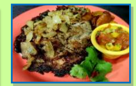
Tropi Chopi Pork