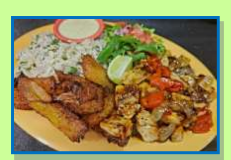
La Gordita Puerco