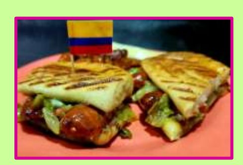
Grilled Choripan Sandwich