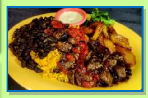
Jamaica me Crazy