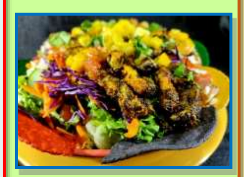
Jamaican Jerk Chicken Salad