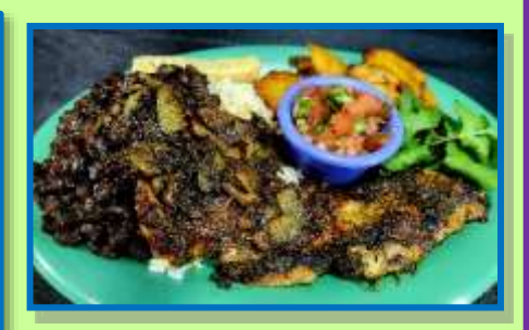
Jamaican Jerk Chicken

Seasoned and garnished ground beef, served on white rice, Tostones, side salad and sliced Avocado.