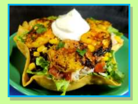
Garlic Shrimp Taco Bowl

Black Angus Steak Tips ----- $18.99 Shrimp, Chorizo or Chicken ----- $17.99 Vegetarian (Bollo) ----- $16.99