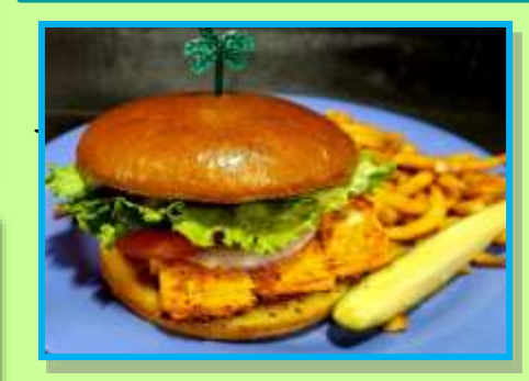
Grilled Mahi Sandwich