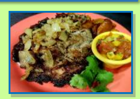
Tropi Chopi Pork

2 Slices of Charbroiled Pork Loins and grilled onions, Glazed in Guava sauce served with Seasoned Green Rice, sweet plantains and side salad